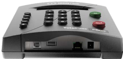
TotalPass P600 Time Clock