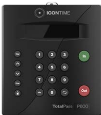
TotalPass P600 Time Clock

Below are the contents included with your TotalPass P600 time clock. If anything is missing, please contact our support line for a replacement: 1-800-847-2232.