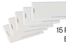
15 Proximity Badges