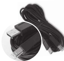
15' USB Cable