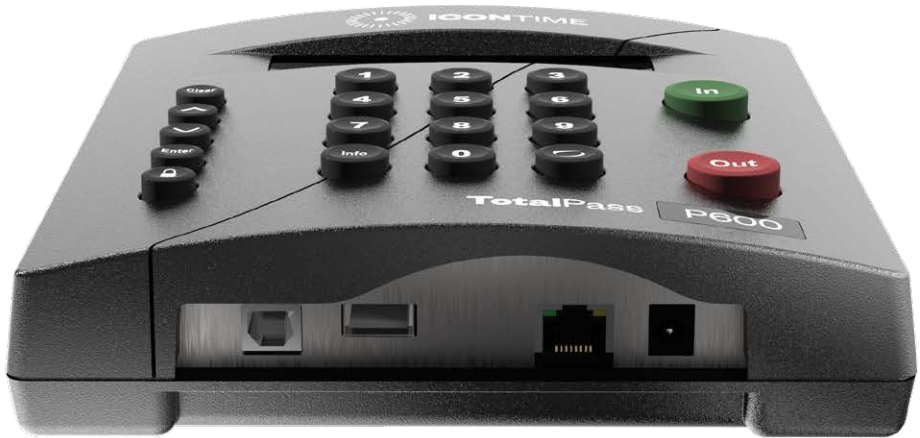
TotalPass P600 Time Clock

The TotalPass P600 time clock includes three connection options: Wi-Fi, Ethernet, or USB.