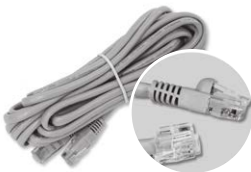
15' Ethernet Cable