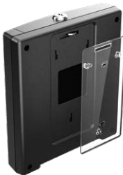
Back View with Mounting Bracket