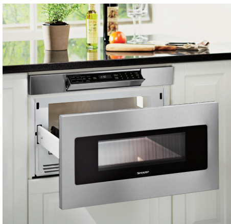
Cooking and cleaning is made easier by putting the microwave at an accessible height. (Installed under a counter)