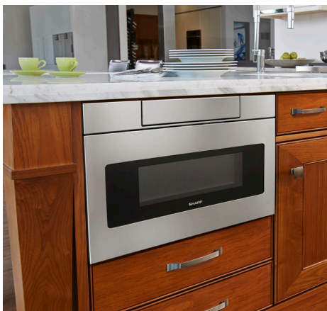
1.2 cu. capacity large enough for a 4-qt casserole dish and tall enough for a large, 20 oz. beverage cup. (Installed in a kitchen island)

The Sharp Microwave Drawer™ Oven boasts an easy-to-read display that disappears until you need it. The concealed control panel opens at a 45-degree angle, so it's easy to read and operate. Sharp's exclusive Easy Touch Automatic Drawer system eases open with the touch of a button. Give the drawer a small nudge and it smoothly shuts for you. The even, gliding action and solid construction helps prevent liquids from spilling during opening and closing.