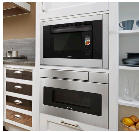
Designed to complement the widest range of kitchen styles and appliances, including our SuperSteam+. (Paired with a built-in wall oven)