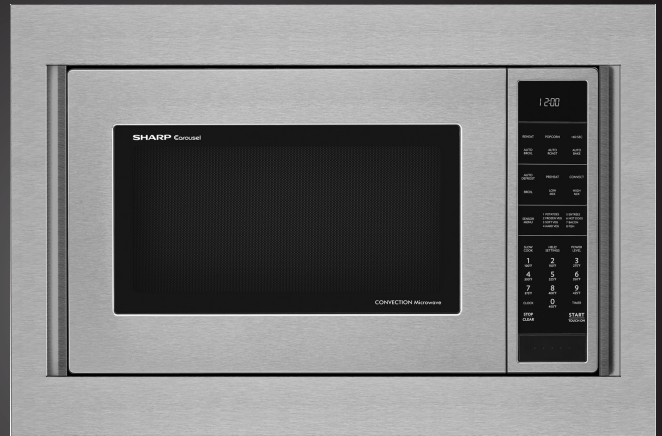
SMC1585BS Convection Microwave Oven with the RK94S30F Trim Kit

Includes Ducting, Finish Trim, and Easy-to-Follow Instructions